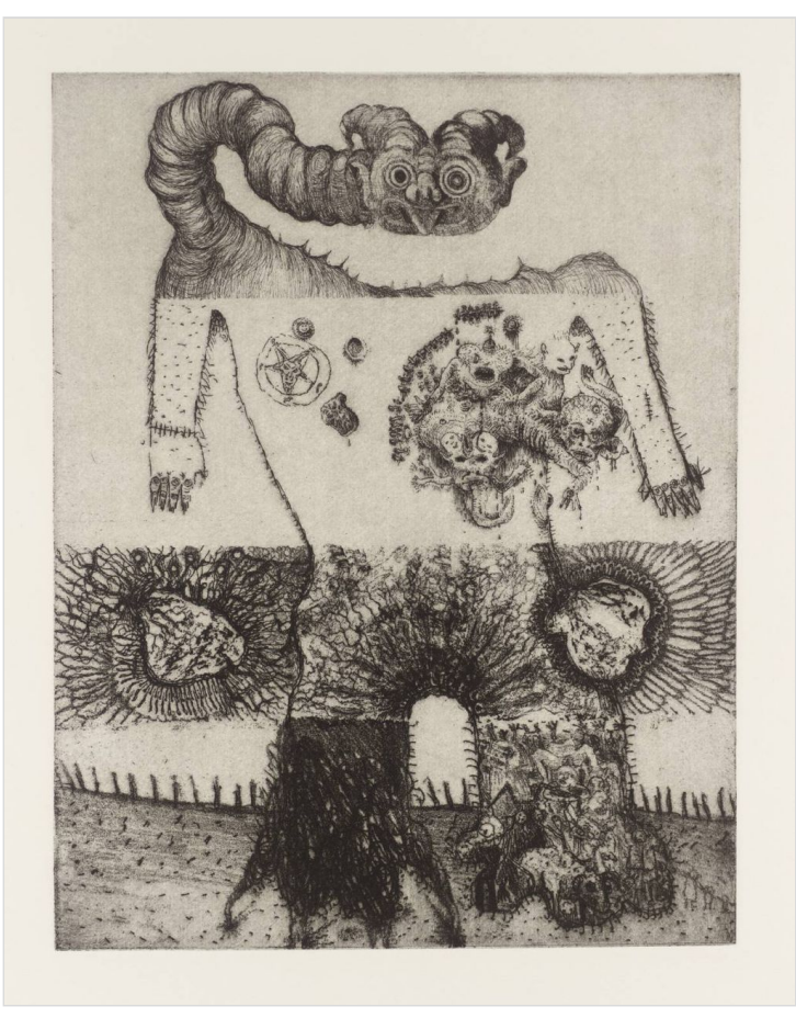
OH NO, I THINK IT'S DEAD(line) AGAIN!

For example, is it best to develop some sort of uniform framework / template on which you all create you characters? Will this help provide the outcome with a greater sense of cohesion OR is a lack of cohesion the point? What size / format should you work on? There are technical and practical considerations that are best defined at the start of the process, such as how bleed and binding will be dealt with and possibly impact your work.